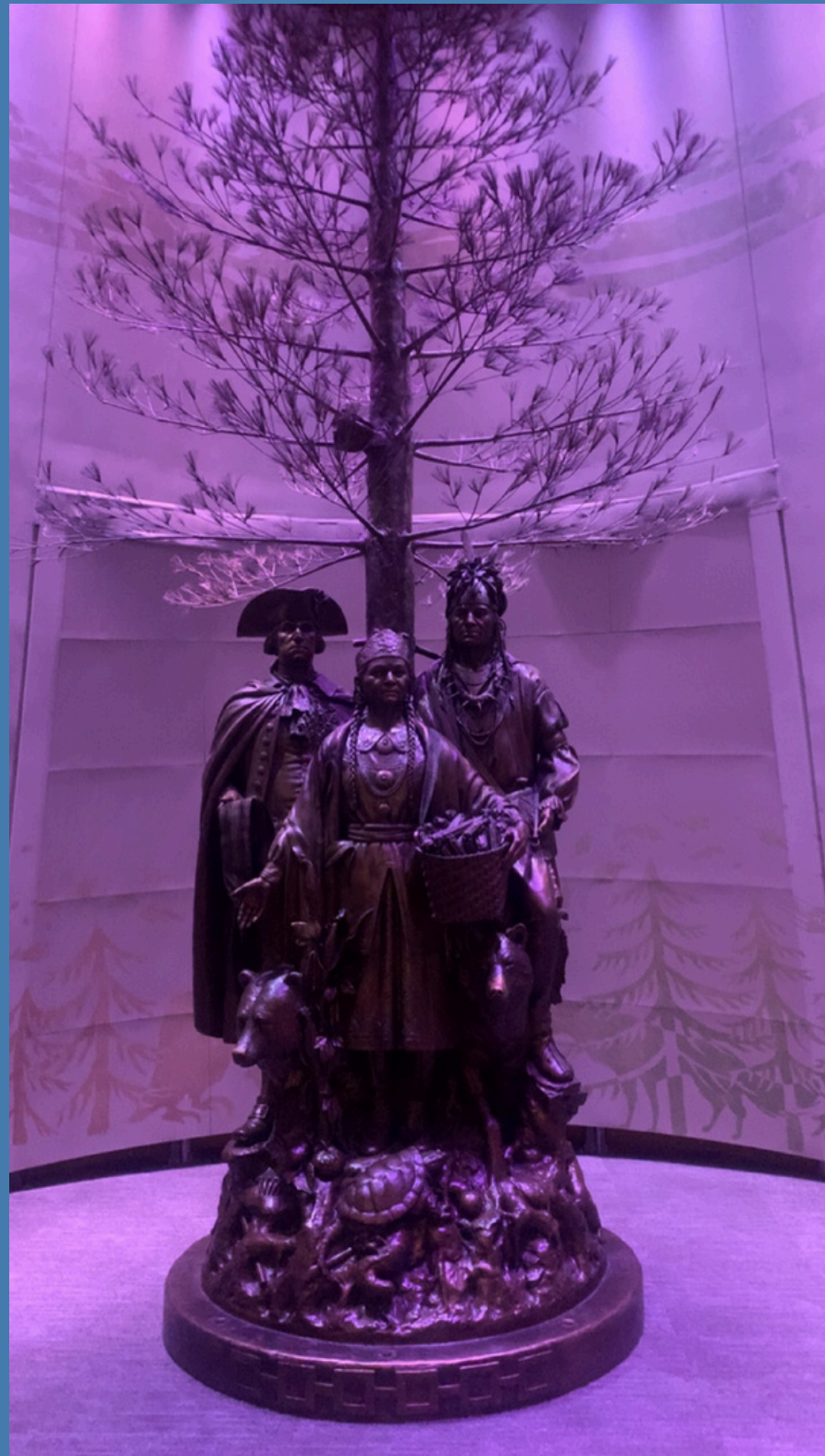
National Museum of the American Indian