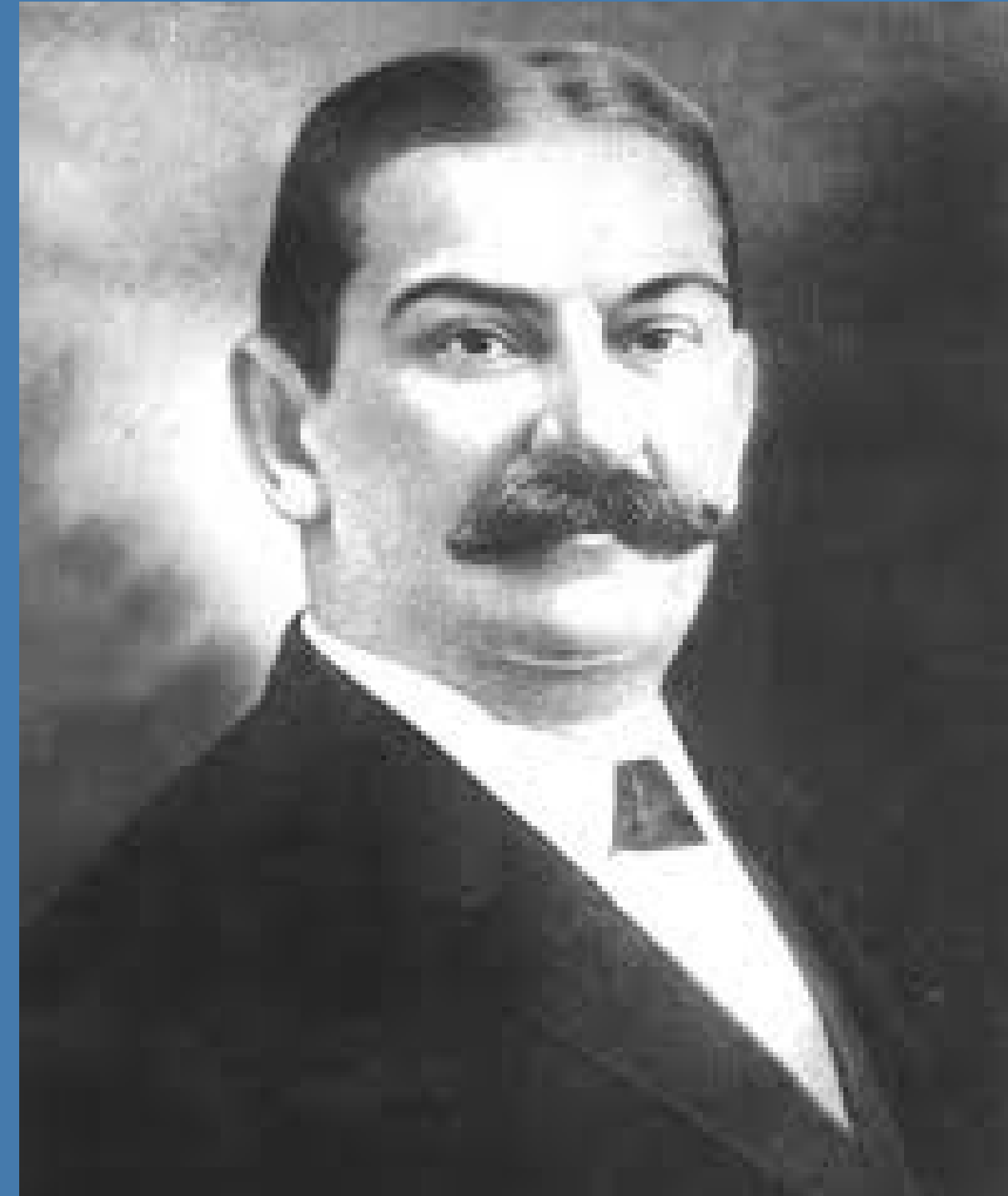
Luis Muñoz Rivera