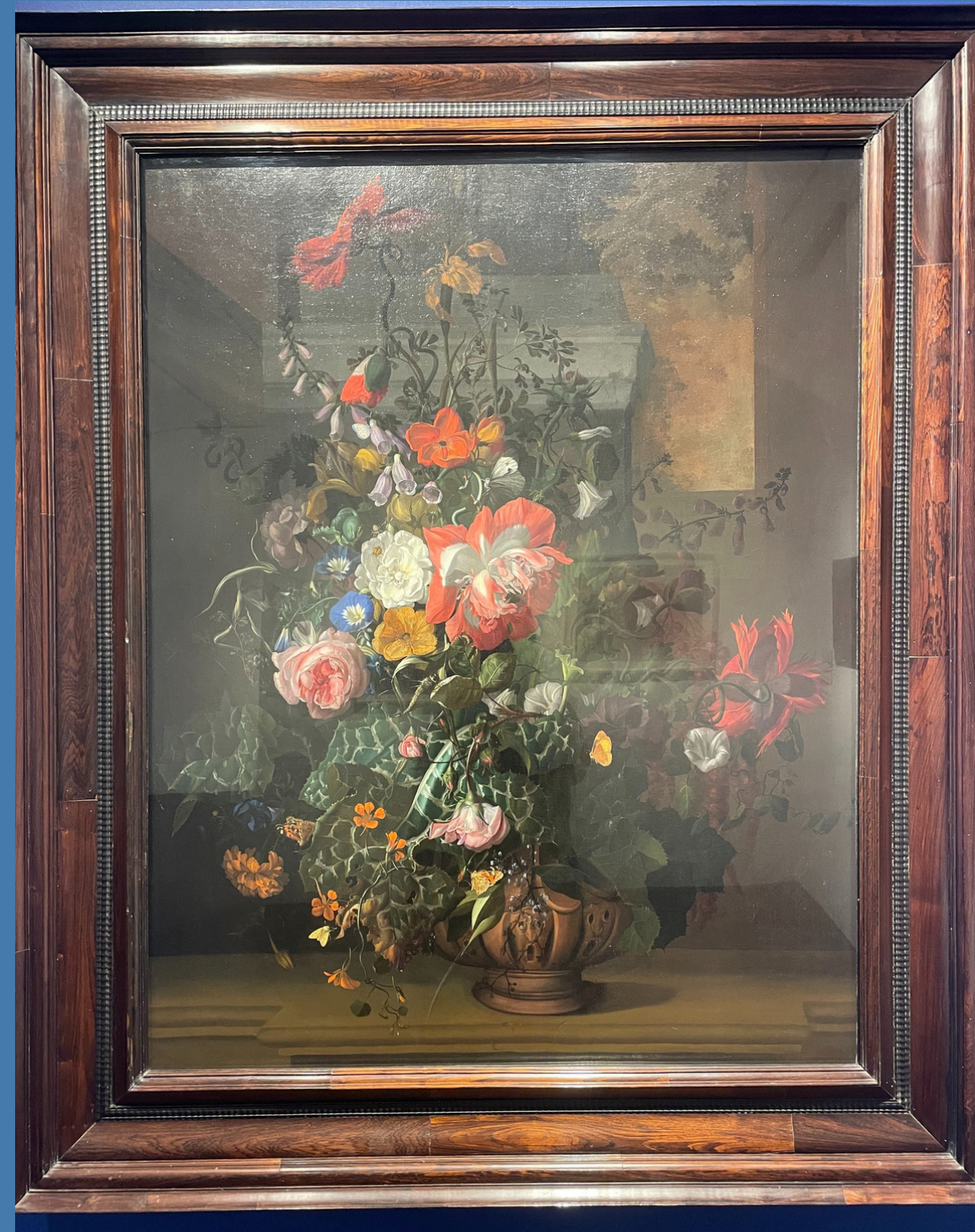
National Museum of Woman in the Arts