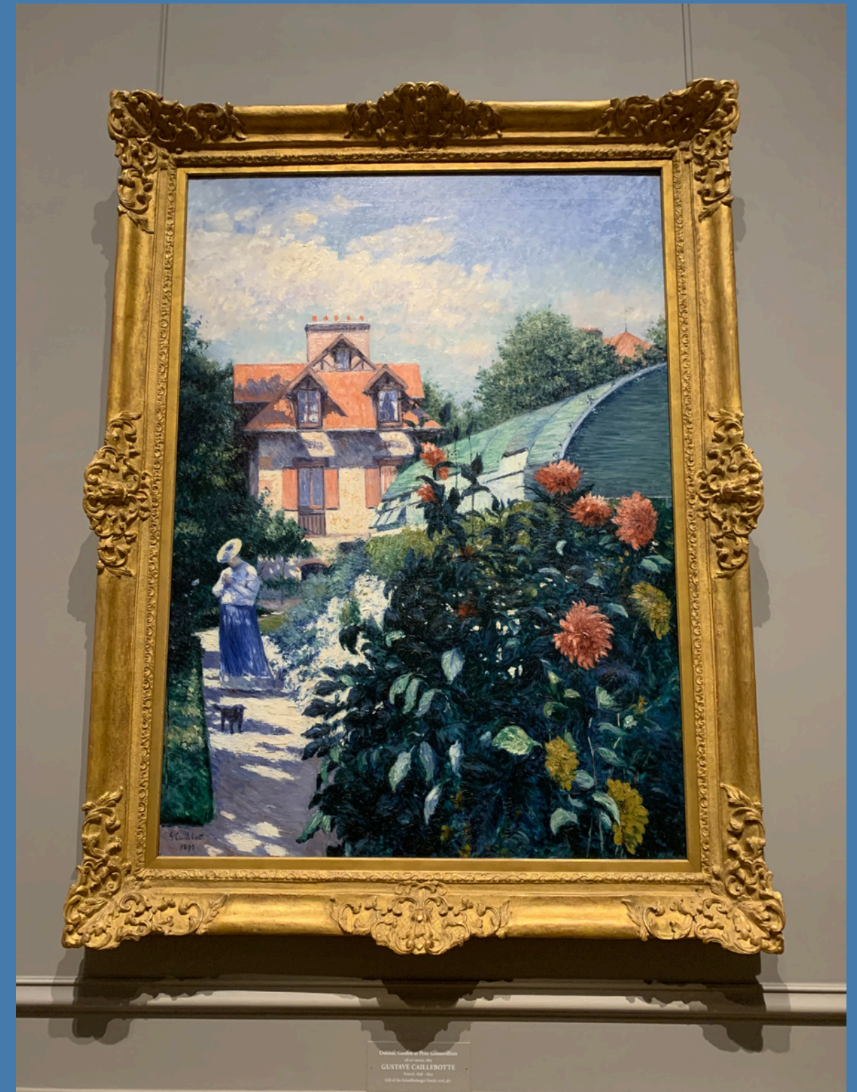
National Gallery of Art