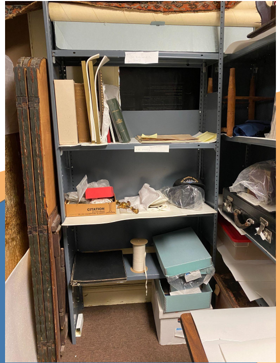
Image of the space I was tasked to organize, courtesy of my photos