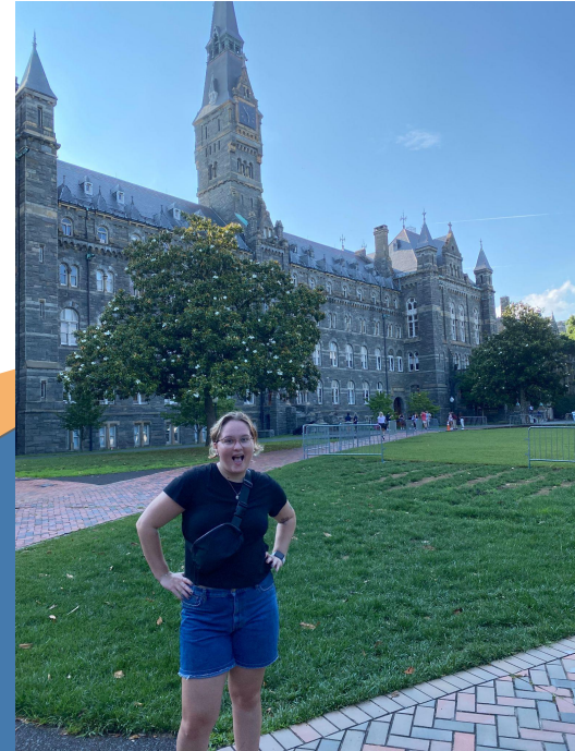
Image of me in front of Georgetown for the first time